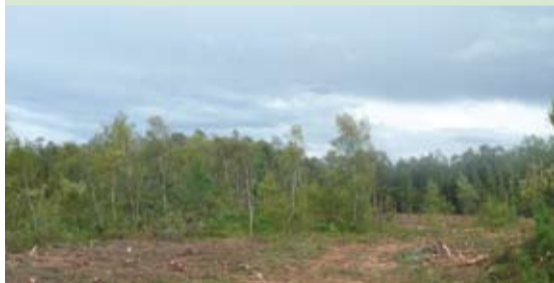
Birch woodlands at the edge of raised bog