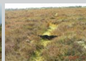
Drain blocking using plastic