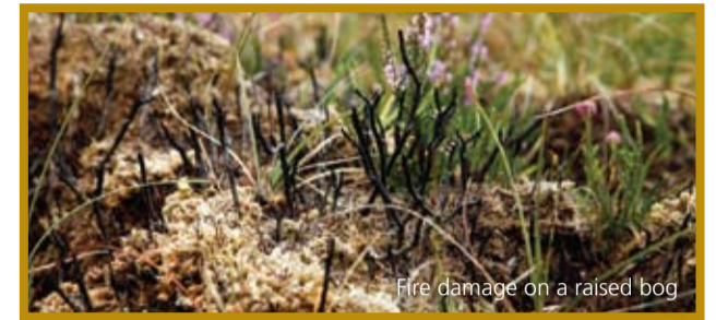
Fire damage on a raised bog