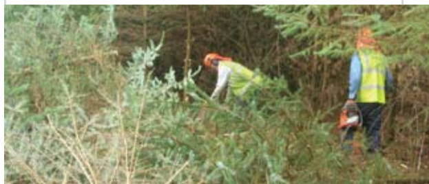
Manual felling of conifers by chainsaw