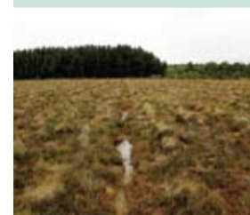
Damage to raised bog