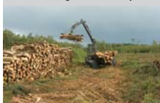
Removing plantation forests