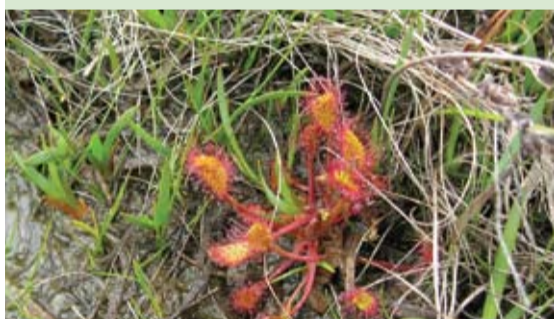
Insect 'eating' plant - sundew