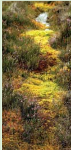
Sphagnums in drains