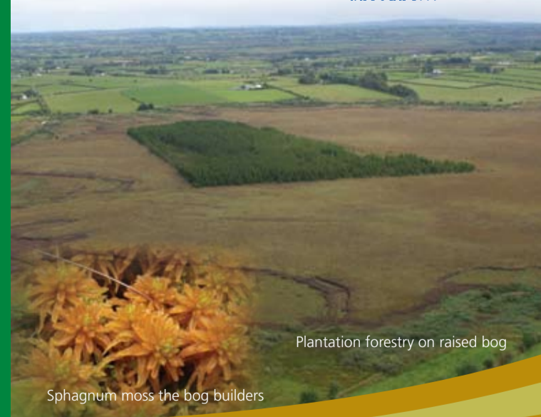
Plantation forestry on raised bog